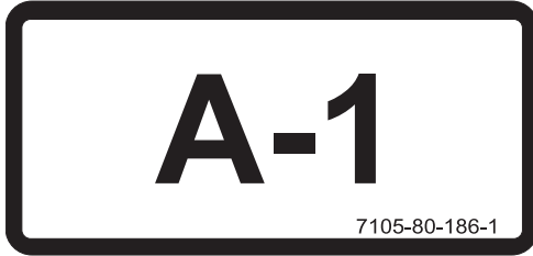
#7105-80-186-1 2.687" x 1.312" Actual Size (others shown at 50%)